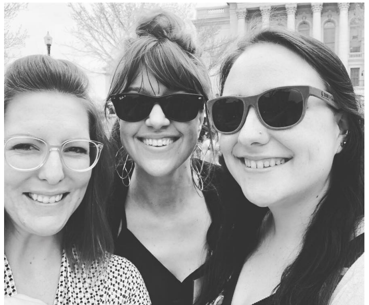
NAMI Dane County staff at Action on the Square.

3 Expansion of Building Bridges - a school-based mental health program - to Monona Grove School District. In this program, trained and experienced staff connect students and their families to resources, develop and promote emotional wellness, and provide school staff with professional development consultation on mental health and trauma-related