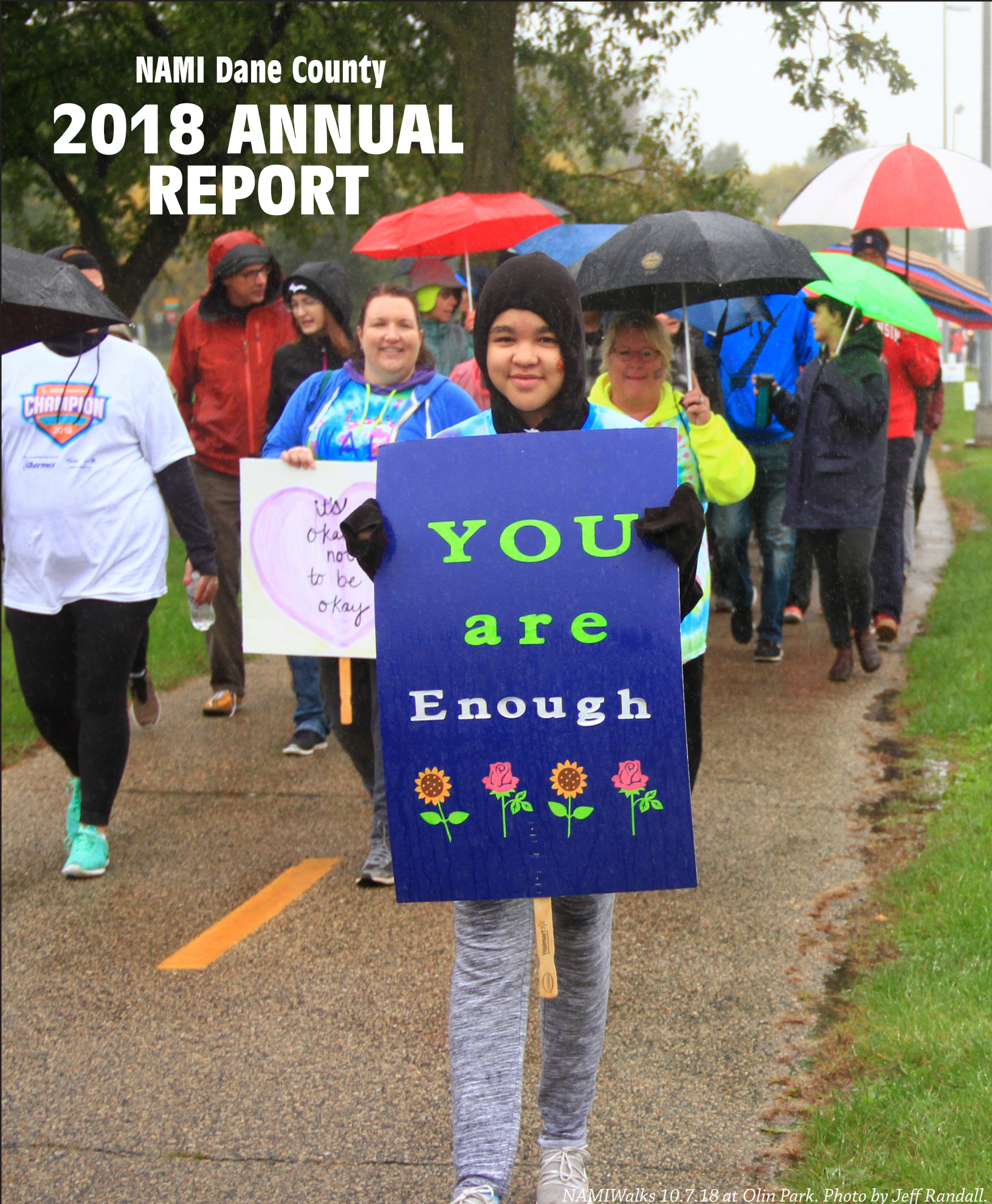
NAMIWalks 10.7.18 at Olin Park.