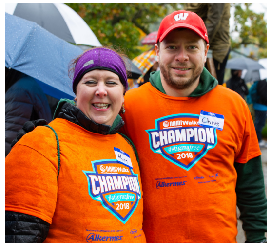
2018 NAMIWalks Dane County.