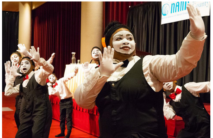
Dane County youth perform a musical entertainment piece at the 2018 Awards Banquet and Gala.